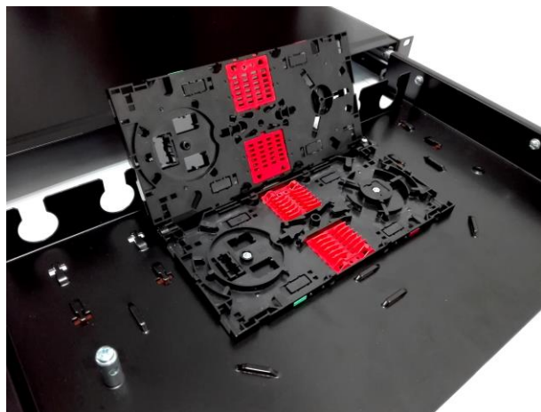
Hinged splice cassette