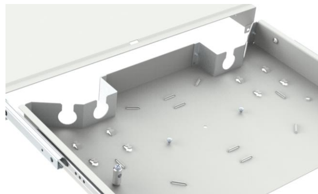
cable entries at an angle of 45° + perpendicular in PST-A2-x type